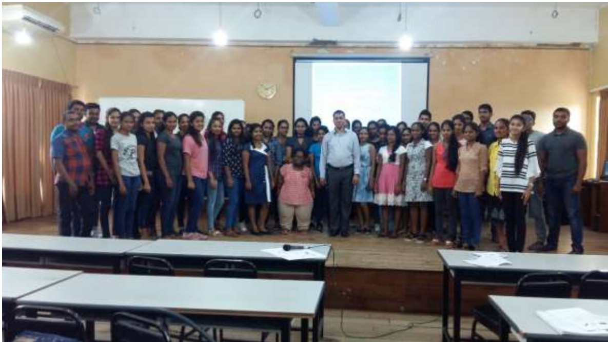
NIBM - Certificate Course Lecturing