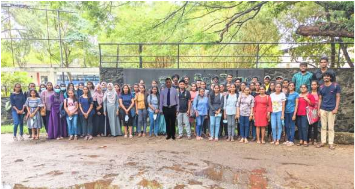
Ocean University of Sri Lanka – Undergraduate Lecturing