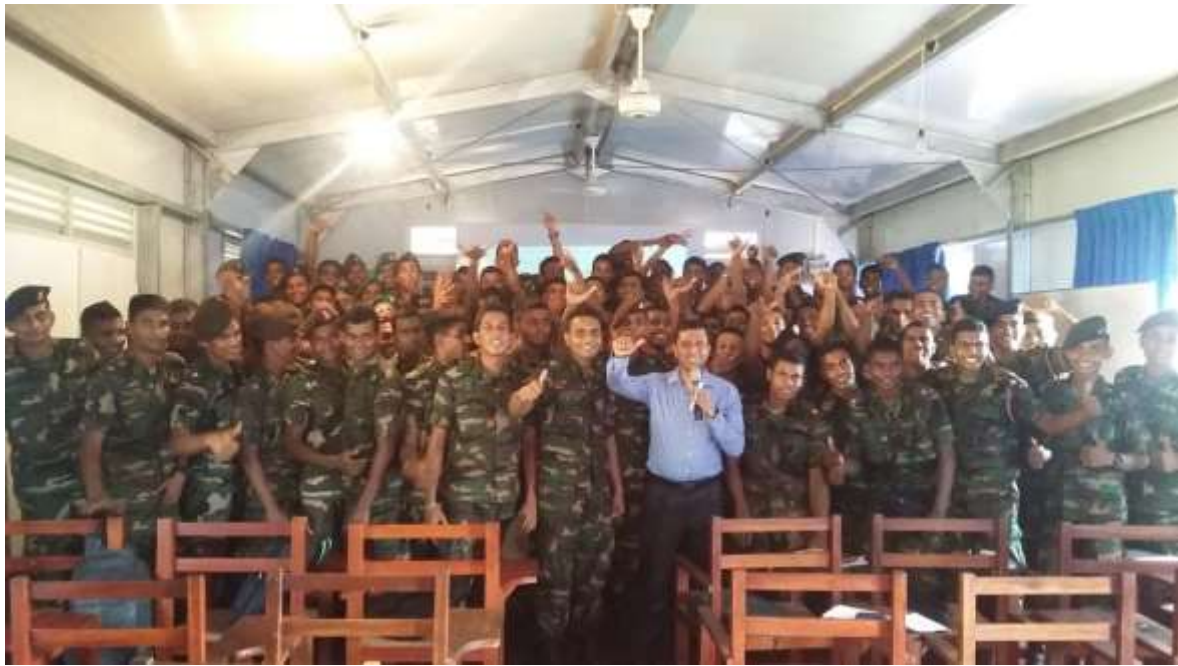
Ministry of Defence (Young Officer Course) – GIS Lecturing