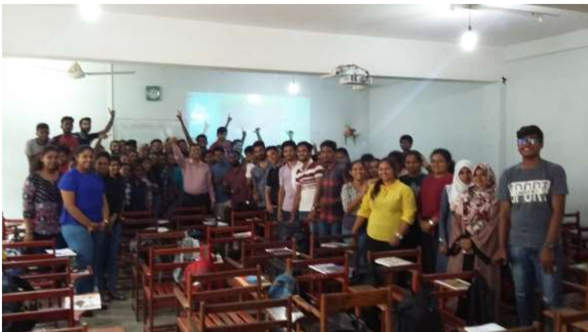
SLIATE - Undergraduate Lecturing